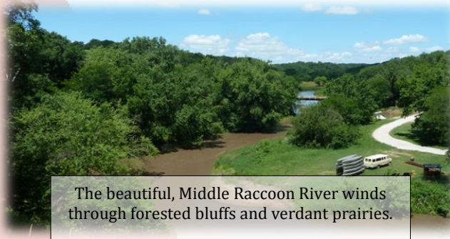
The beautiful, Middle Raccoon River winds through forested bluffs and verdant prairies.